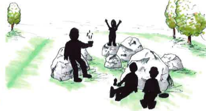
This seating area highlights the contrast between the sweeping grass plains and the rugged mountain ranges. The Avon River can be seen in the background.