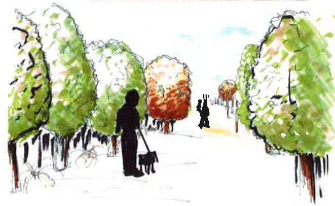
Sketch showing entrance into site which is lined with dense vegetation. This provides an enclosed feeling in which you are not dwarfed by high vegetation. This space opens completely once you venture around the corner.