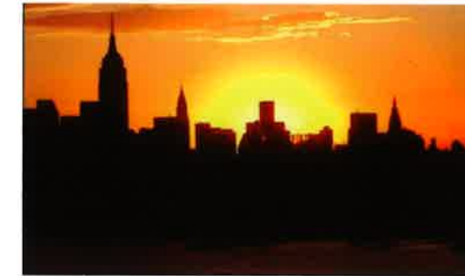
The Eastern wall of the site is shaped to reflect the mountain terrain of the region while replicating the effect of a sunrise and the bringing of light and life to the site everyday. This is in connection with the ideas of Eastern European artist Jan Matejko (1838 - 1893), who wanted to show the regions "bright his tory in the dark days".